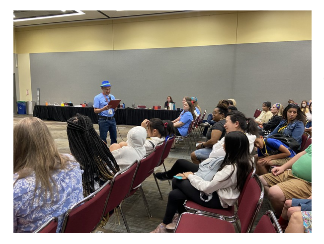
Image Description: Rows of spectators are seated in chairs, watching a volunteer who is speaking into a microphone.

Spectators will not be allowed to view any Instant Challenge presentations.