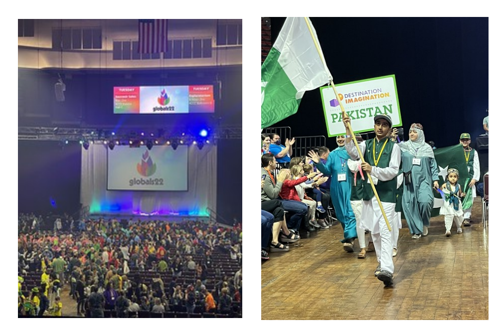
Image Descriptions: At left, the crowd inside the Municipal Arena for Global Finals 2022. The audience is facing a stage with a colorful sign that reads "Globals '22." At right, a team from Pakistan walks in the Parade of Nations during the Welcome Ceremony. They are carrying their nation's flag and a sign

that reads "Destination Imagination Pakistan".