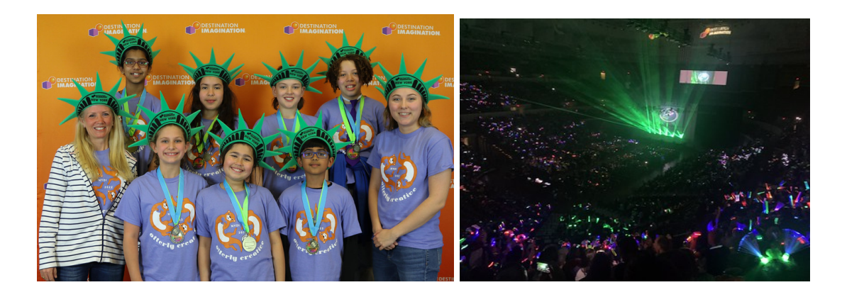
Image Descriptions: Above, a team poses in front of an orange backdrop at the Global Finals 2022 Closing Celebration. They are wearing matching purple shirts and the medals they won. At left, a wide shot of the crowd inside the arena at the Global Finals 2022 Closing Celebration. The area is dark but illuminated by a laser show on the stage and light-up toys/hats throughout the audience.

The Closing Celebration is usually a high-energy event with lots of crowds and noise. Audience members are welcome to clap and cheer as they see fit. The Closing Celebration often includes a laser show. During the laser show, the arena lights will temporarily be turned off.