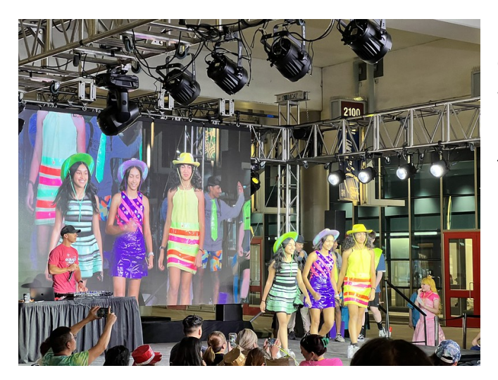
Image Description: A team wears brightly colored duct tape outfits on a brightly lit stage while an audience applauds for them. The team is also visible on a video screen at the rear of the stage.

The Box 'n' Ballers Bash will take place on Thursday, May 23 from 7:00-9:00 p.m. in the streets surrounding the Kansas City Convention Center. This event is a large team celebration that will include street performers, balloon artists, stilt walkers, and a runway fashion show. You can expect very large crowds surrounding these performers in the street as well as a lot of noise, music, and emceeing from the runway fashion show. In the case of rain, this event will move into the Municipal Arena and Lower Exhibition Hall.