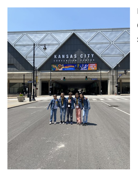
Image Description: A team poses outside of the Kansas City Convention Center, in front of the entrance at Central and 13th Street.

Upon arrival, Team Managers should check in at Team Registration in the Little Theatre inside the Municipal Arena. At registration, you will receive credentials, which must be worn inside the Kansas City Convention Center.