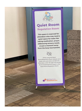
Image Description: A white vertical banner with a purple border and purple/black text. The header reads "Quiet Room/Regulation Room." Below, in smaller text, is a description of Quiet Room uses that matches what is listed in the above paragraphs.

While using the Quiet Room/Regulation Room, please use a quiet voice and silence all non-medical