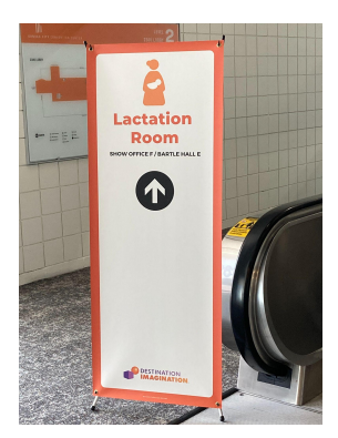
Image Description: A white vertical banner with an orange border and orange/black text. It reads "Lactation Room," with an orange icon of a nursing parent and black arrows directing to the correct room.

A private space exclusively for nursing parents can be found in Show Office F in Bartle Hall.