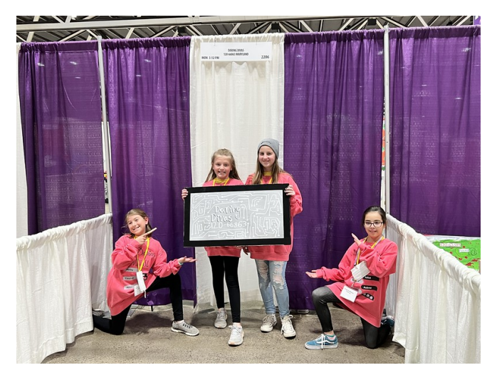
Image Description: A team poses with their team sign inside their booth at Prop Storage. The borders of their booth are lined in purple and white curtains.

Prop Storage is a vast space that is often crowded with people and props in motion! There is often lots of noise and action. Learn more about the Prop Storage schedule, as well as how to deliver your team's props to Prop Storage, on the <u>Global Finals website</u>.