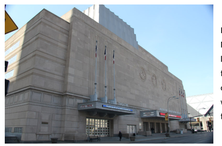
Image Description: The exterior of the Municipal Auditorium during the day. It is a large stone building with art deco design features. There are two marquee entrances, one of which is labeled "Little Theatre," which is where Team Registration can be found.

If you have been to Global Finals in Kansas City before, you may notice that the space has changed. It is normal for spaces to change, especially when they are used by many people! When you arrive, you may notice that there are different things hung on the walls, different furniture arrangements, or even bigger changes. You may notice smells that you didn't expect, or lights that are brighter or darker than our photos. We know that DI participants can use their creativity to adapt to these changes.