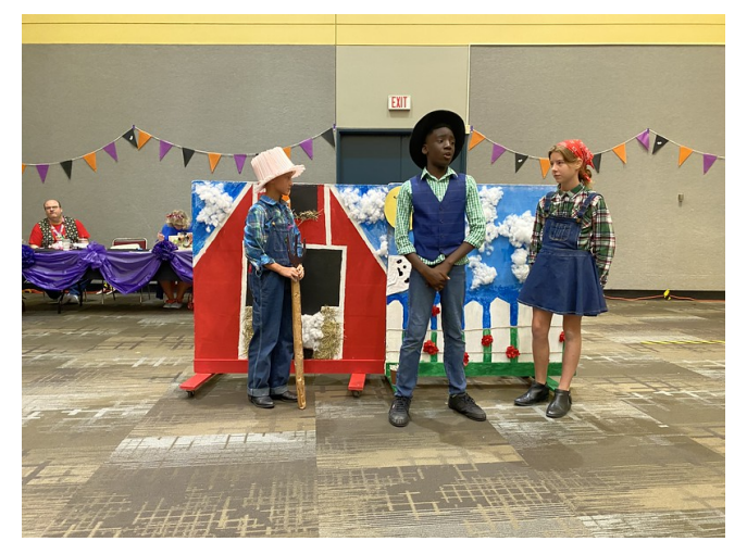
Image Description: A Presentation site from Global Finals 2022. A team is performing with colorful scenery and costumes. Behind them is an open, classroom-style space with gray carpet and walls. In the background, a team of Appraisers is watching from a table.

When the team members are done with their Presentation, the Appraisers will ask them a few questions before they leave. Audience members can remain on the Presentation Site during these questions. After speaking with the Appraisers, the team will take their Presentation materials out of the Presentation Site. At this time, parents and team supporters may help the team remove materials from the Presentation Site.