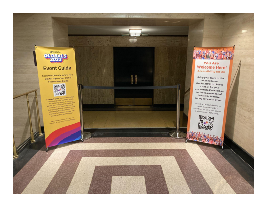
Image Description: Signage inside the Little Theatre at Municipal Auditorium. On the left, a yellow vertical banner reads "Globals 2023 Event Guide" and features a QR code to view the document. On the right, a colorful vertical banner has the header "You Are Welcome Here" with smaller indecipherable text. The QR code takes the viewer to DI's webpage about its inclusion policies.