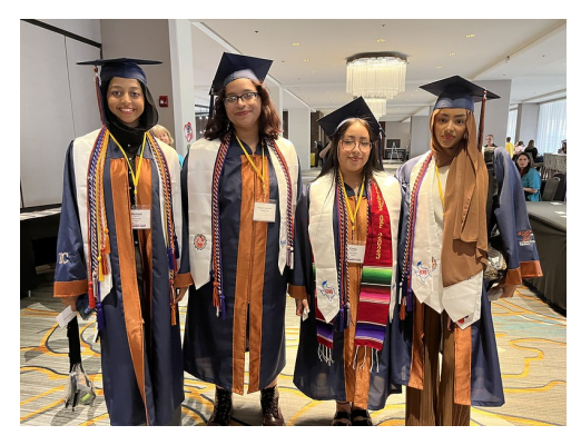
Image Description: A DI team wears graduation robes, hats, and regalia as they stand outside the Basie Ballroom.

The Graduation Ceremony will include speeches and a slideshow presentation. Audience members are welcome to clap and cheer as they see fit.