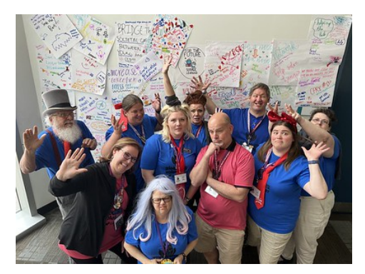
Image Description: A group of DI volunteers, wearing vibrant t-shirts and accessories, posed and smiling in a group. The wall behind them is covered in papers with colorful writing.

All tournament participants and spectators are welcome to wear comfortable, weather-appropriate clothing. Our volunteers often wear vibrant, colorful clothing and hats to celebrate the event. It is also highly likely that you will see team members in costume for their Presentations.